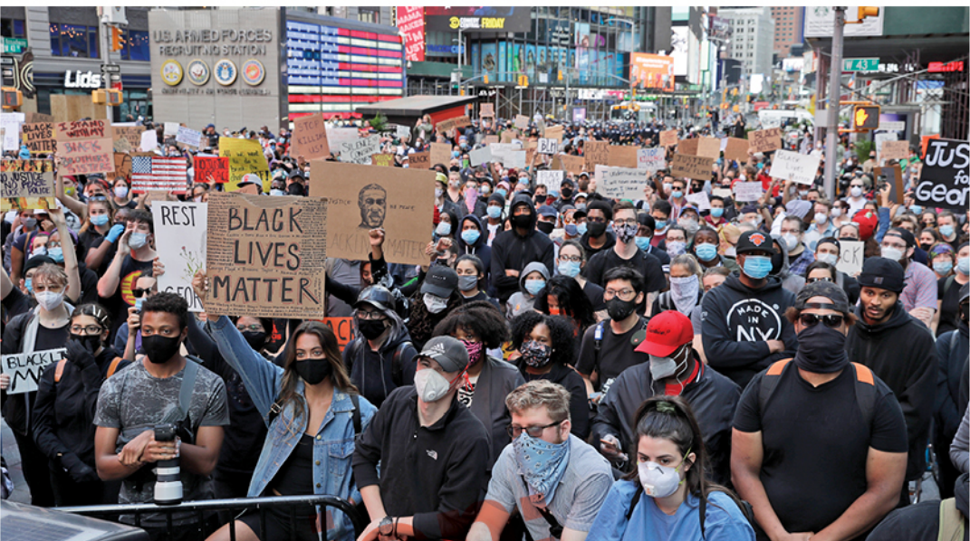
Nationwide demonstrations that broke out in response to the police killing of George Floyd in Minneapolis in late May just as the country was beginning to open up is making restarting local economies harder and risking the flare up of Covid-19 hotspots across the country. This could potentially undo the progress made against the pandemic after several months of lockdown. If dense protests don't accelerate the spread of the virus, then it may enhance the near-term outlook for the economy.